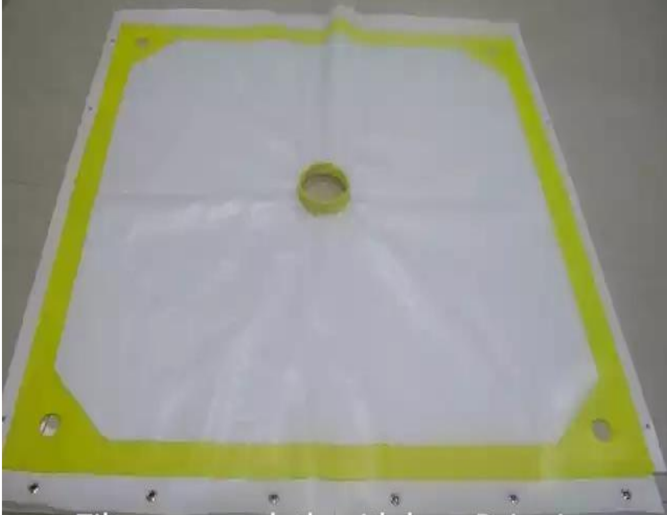
Filter press cloth with less Dripping technology