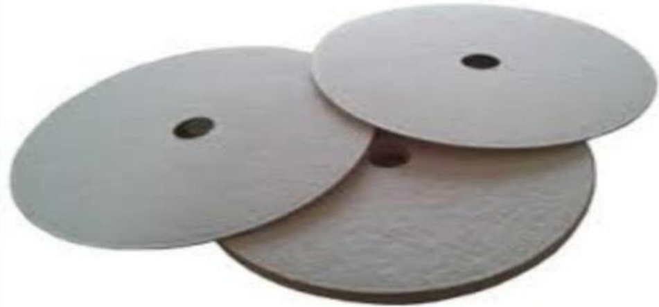
SPARKLER PAD— WOVEN ,NON WOVEN ,CELLULOSE